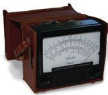
1978. Harrison Steel seeks our services for their air handling systems.