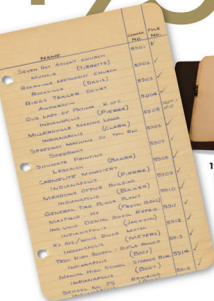
1959. Page one of our original, handwritten log book shows the diversity of early clients - offices, churches and Indiana University.