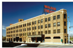
1986. Another high-profile project, the restoration of the historic Madame Walker Theatre.