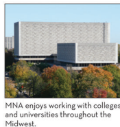
MNA enjoys working with colleges and universities throughout the Midwest.