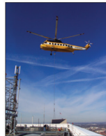
2005. Solving difficult problems can often require extraordinary effort - like installing this 21,000-pound chiller on the roof of One Indiana Square.