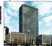
1991. MNA designs a fire protection system for the City County Building, an Indianapolis landmark.