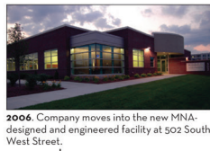
2006. Company moves into the new MNA-designed and engineered facility at 502 South West Street.