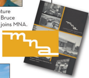
1977. MNA marketing materials sport a new logo and color scheme.